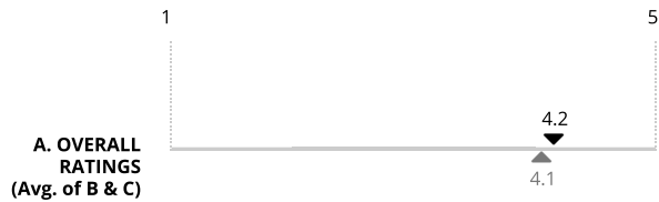
Your Overall Mean Ratings 5 Point Scale